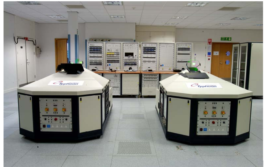
The Eurofighter Systems Simulator Rig (Metalwork designed and manufactured by LUNDS) for BAe Systems that uses the LUNDS Standard Test Benches.

Earth Bonding is handled by 4 off M5 Studs in the base of each Bay and 2 off M5 Studs in the base of each Top Box. All removable panels have an M5 Stud adjacent to one of the main earthing points for easy bonding. Cable entry to the units is by the access cut-outs in the base.