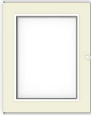
FRONT DOOR GLAZED — LOWER Part No. 040804-347